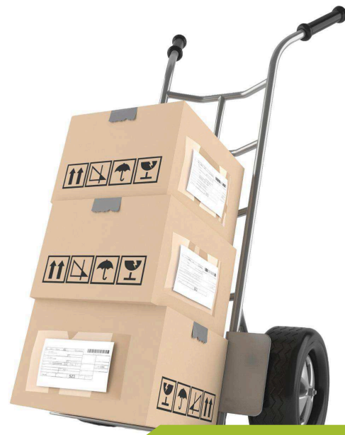
CASE & CARTON SEAL

The Safety Data Sheet should be consulted for proper handling, clean up and spill containment before use. Keep containers covered to minimize contamination.